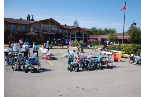
Wild Rose Manor Carnival