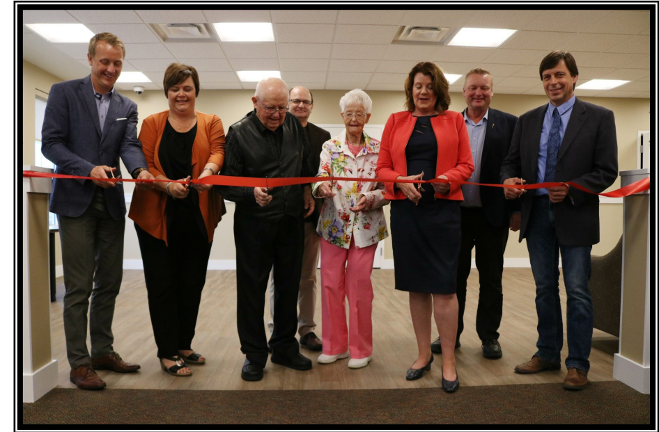
Lakeview grand opening ribbon cutting in Clairmont, August 2017.