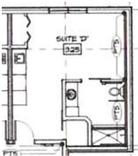
385 Square Feet, Large Lodge

Individually controlled thermostats for personalized comfort · Private three-piece bathroom in every suite · Window coverings provided · All basic utilities, cable and WIFI for a fee · Complimentary laundry facilities for personal use or optional personal laundry service available for a monthly fee